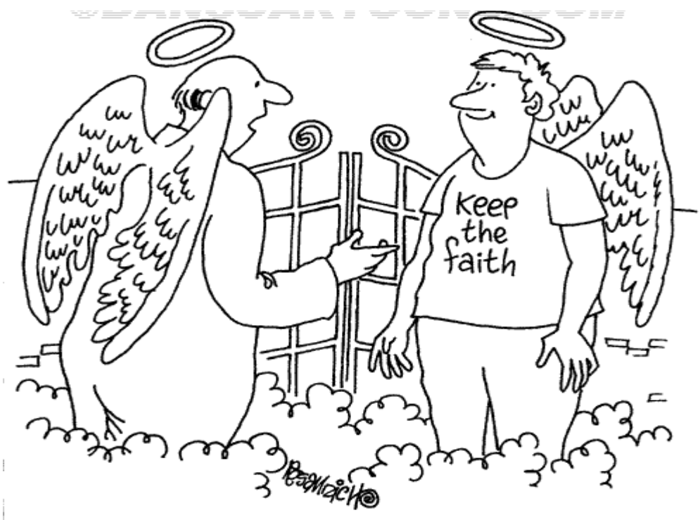
"I really don't think that T-shirt is necessary, now that you're up here."

Littleton United Methodist Church P.O. Box 26 Littleton, NC 27850