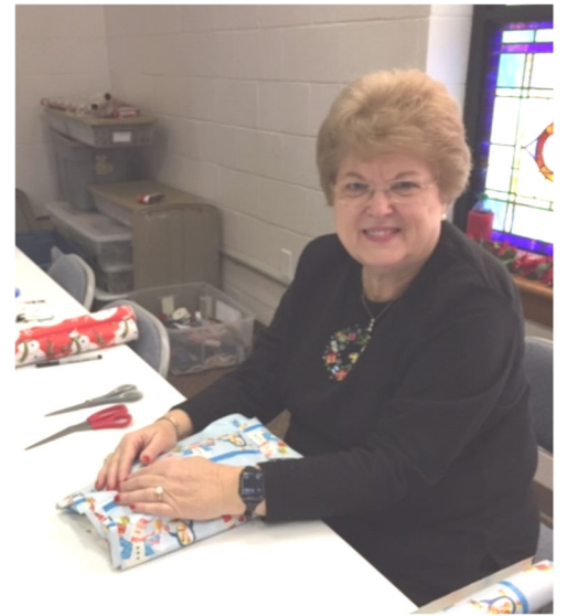
UMW Wrapping Day for The John 3:16 Center December 16, 2019