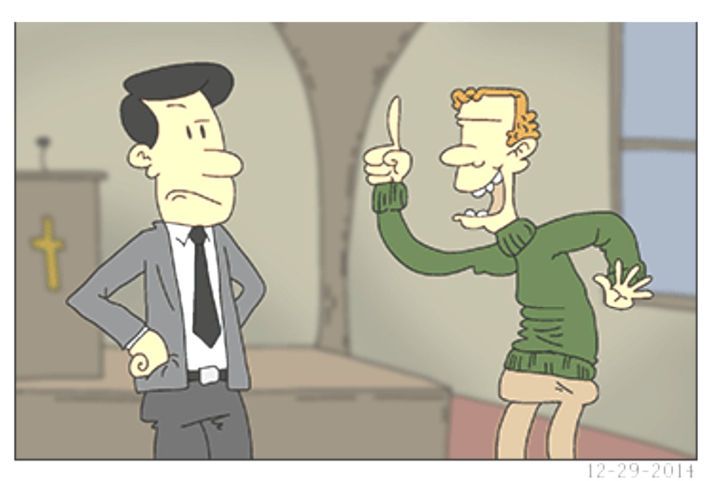
MY NEW YEARS RESOLUTION THIS YEAR IS TO DO THE THINGS I SHOULD HAVE BEEN DOING LAST YEAR

Littleton United Methodist Church P.O. Box 26 Littleton, NC 27850